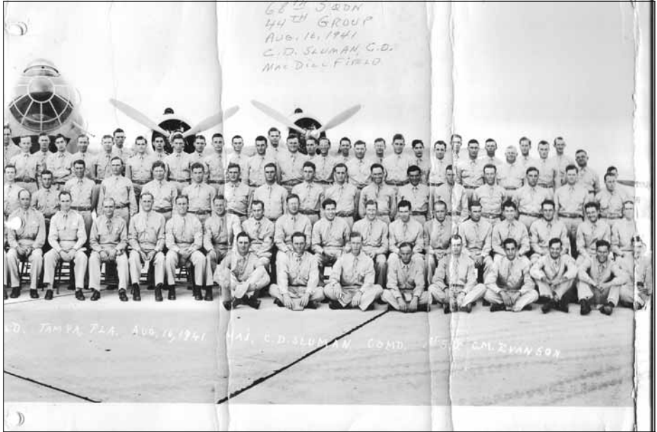
July 1941 – Selective Servicemen of the 68 th Bomb Squadron, at Macdill Field in Tampa, Florida. I am the tallest one on the back row, close to the middle.

Though I had been assigned to the Air Corps, it was as an enlisted man rather than a cadet, so I continued my quest to get into the Cadets after being drafted. This was the only route to becoming an army pilot, which I very much wanted to be.